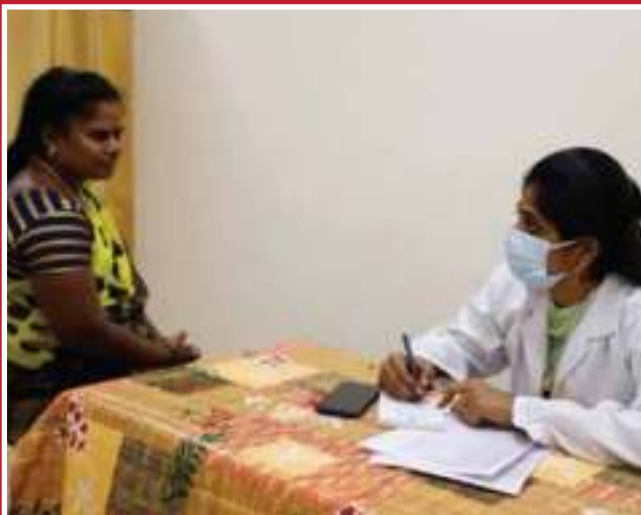
MASTER HEALTH CHECKUP