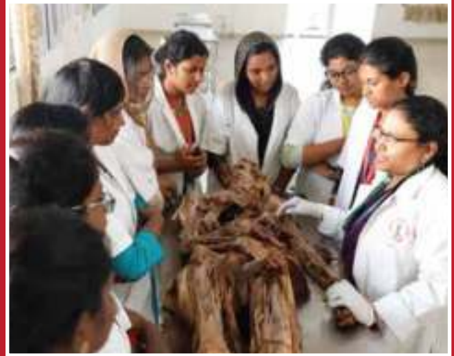
ANATOMY DISSECTION HALL