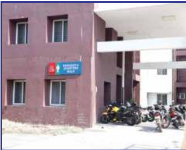
RESIDENT QUARTERS - MALE