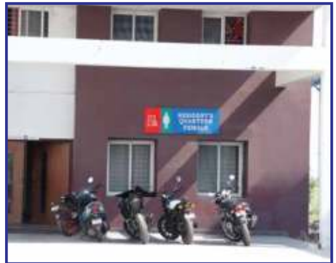
RESIDENT QUARTERS - FEMALE