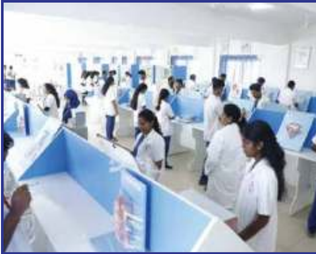
PATHOLOGY & FORENSIC MUSEUM