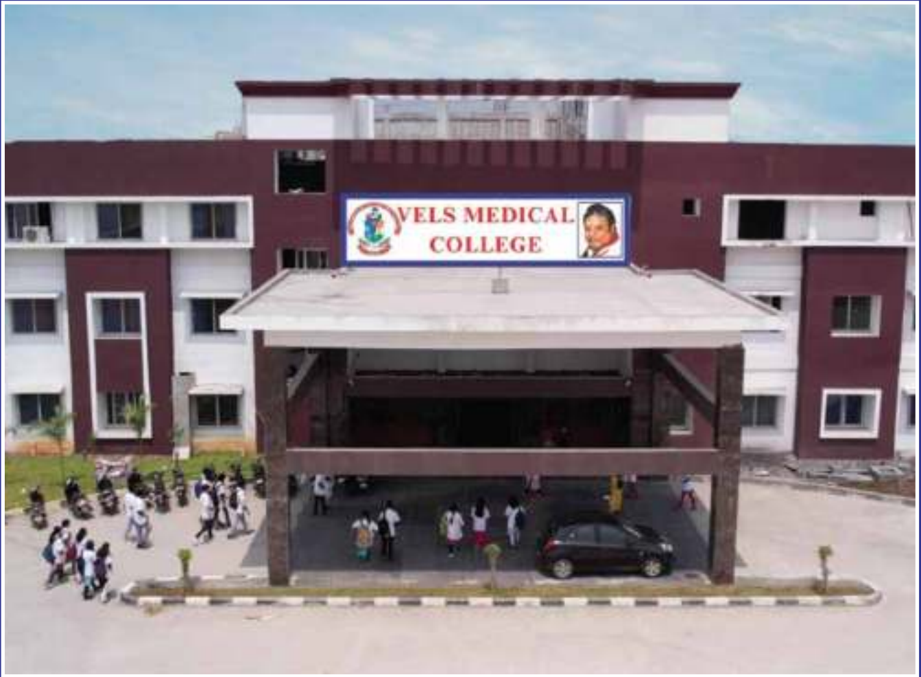
MEDICAL COLLEGE BLOCK