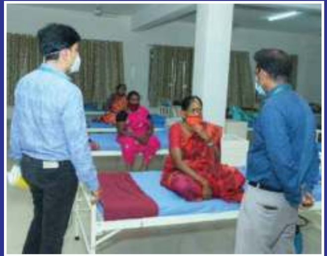
IN PATIENT WARD