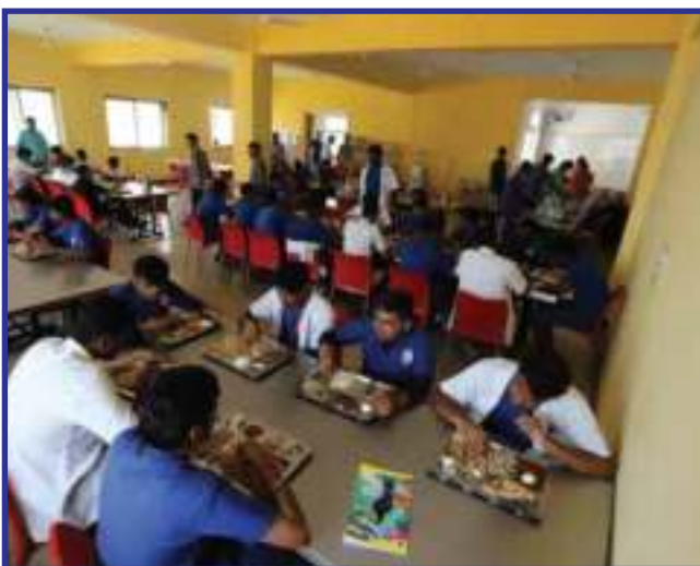
STUDENT DINING HALL